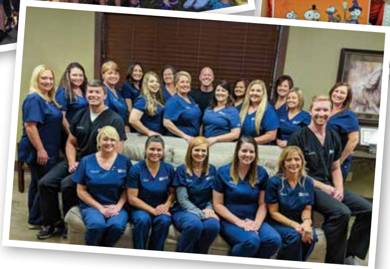
The entire staff of Total Dental Care appreciates the opportunity to serve your dental needs.